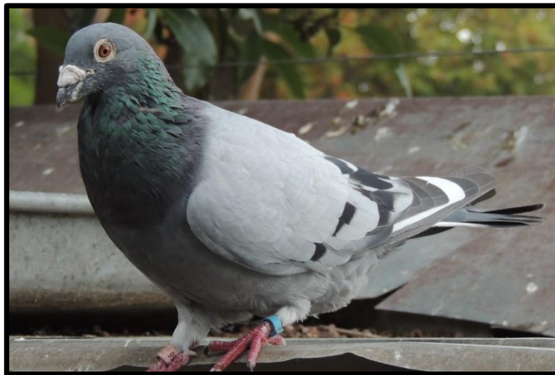
2018 young birds bred off my best VANDENABEELE HOUBEN birds

Lot 6 – SIRE 06-32756 bred from 13425, grandson of WITTENBUIK and 11019. SIRE of the 2018 young birds below