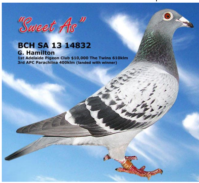
Kindred Spirit-Top producer when paired with Sweet As (The Twins Pair)