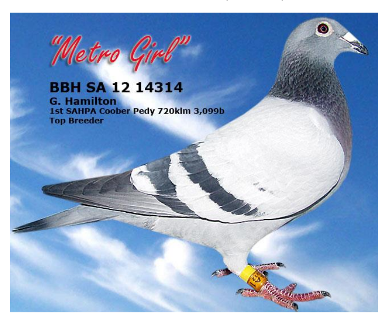
Ermerdream-Champion Racer & Producer